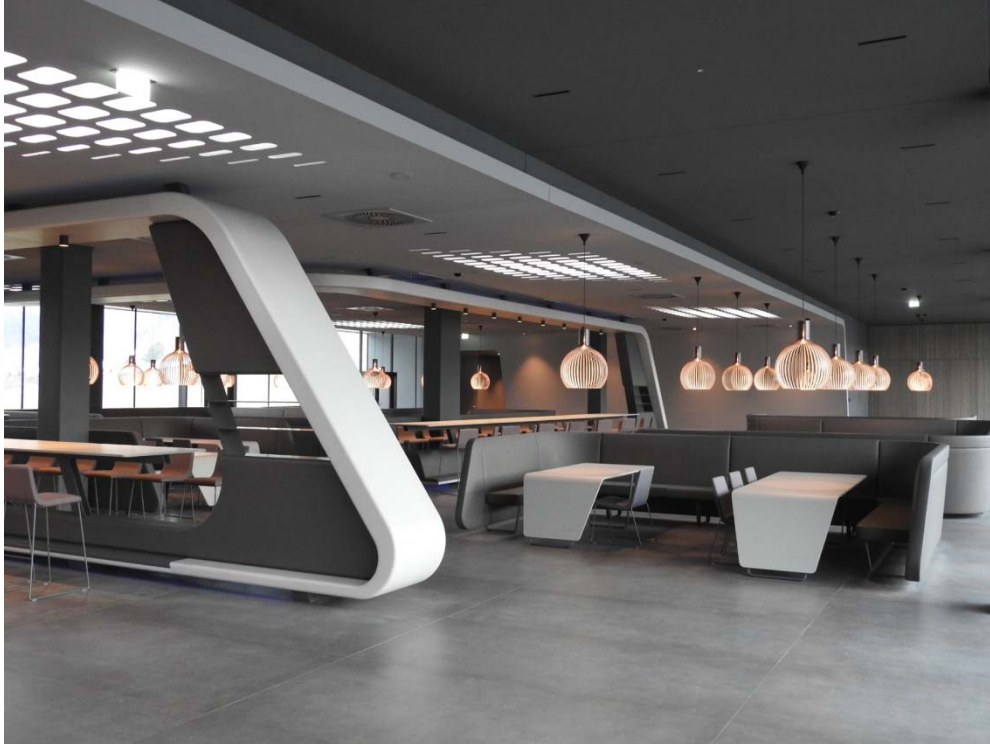
Fig. 2: For the floor, the building owner selected large-format fully vitrified slabs and awarded the contract for tiling to Keramik Bau Weiz (the specialist tiling department of Lieb Bau Weiz GmbH & Co KG), which has used PCI products for many years. The substrate was first primed using PCI Gisogrund 404.