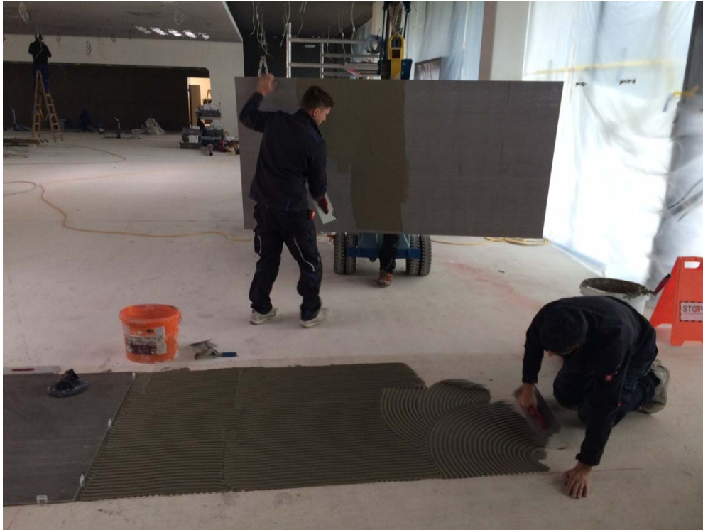
Fig. 3: The tilers laid the 240 x 120 centimetre slabs by the buttering-floating procedure using PCI Carrament grey medium-bed mortar, with PCI Lastoflex polymer-modified additive, especially for laying fully vitrified tiles.