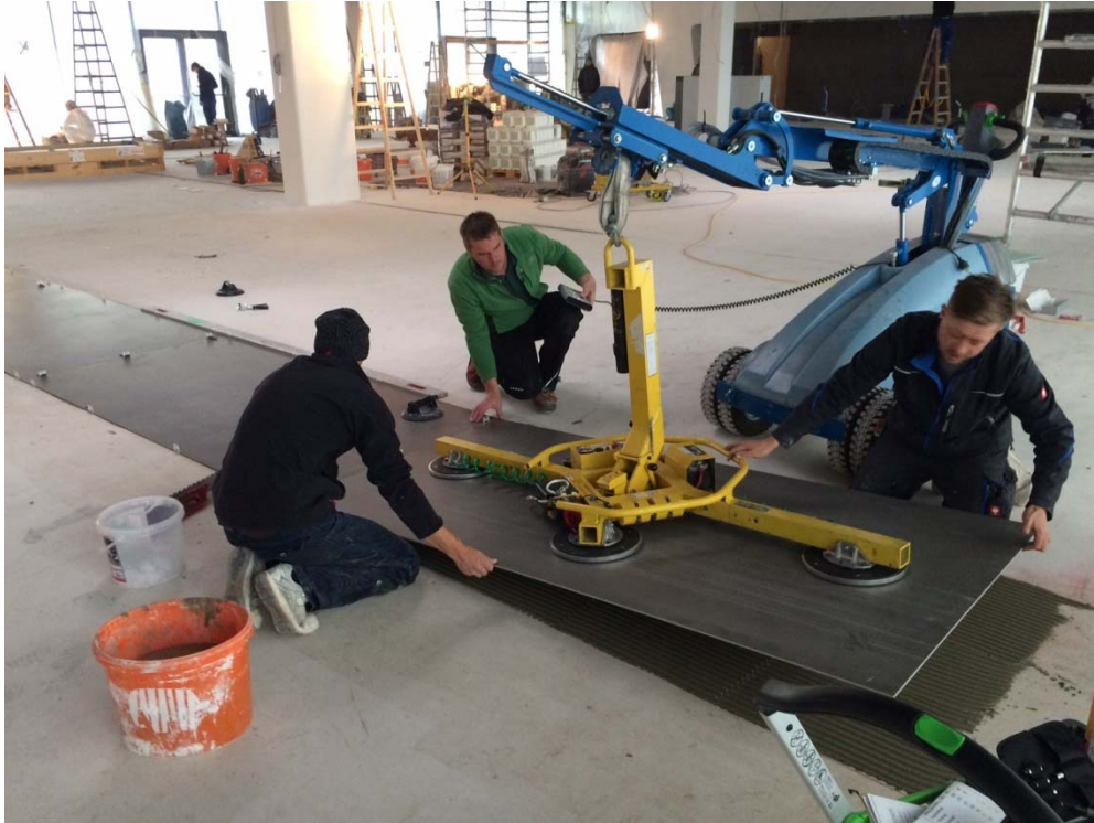
Fig. 5: High-precision work: the large-format tiles are fitted precisely into place. Any corrections that may be needed are easier to make thanks to the use of the crane.