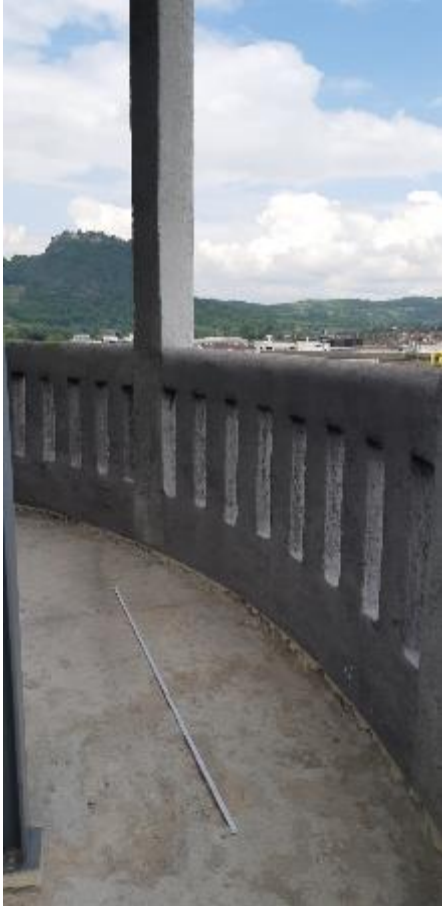
The hollow screed was removed down to the solid, load-bearing concrete ceiling. Link to high-resolution Photo

Sitz der Gesellschaft: PCI Augsburg GmbH Piccardstraße 11, 86159 Augsburg Postfach 10 22 47, 86012 Augsburg Tel. +49 (8 21) 59 01-0 Fax +49 (8 21) 59 01-372