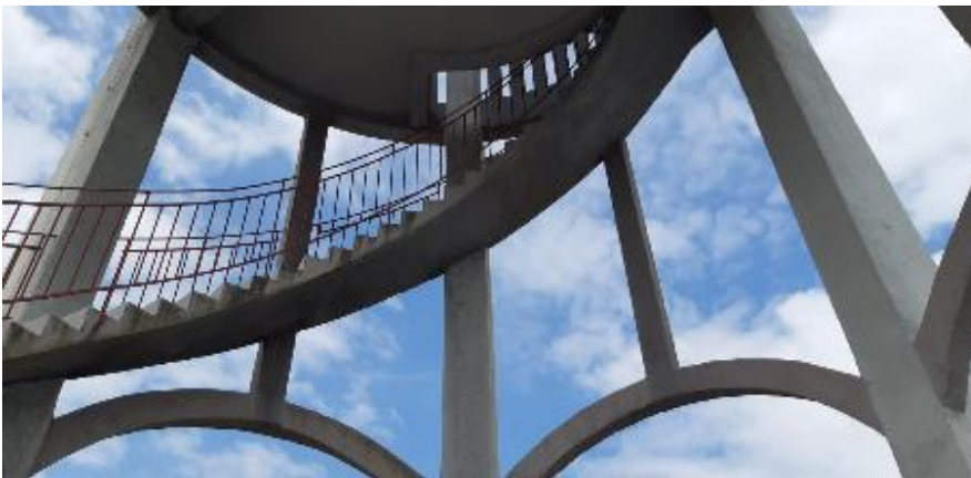
The Maggi water tower in Singen, a masterpiece of formwork and concreting technology, was refurbished on the top arcade with PCI products and is now well protected against all weather influences. Link to high-resolution Photo

Sitz der Gesellschaft: PCI Augsburg GmbH Piccardstraße 11, 86159 Augsburg Postfach 10 22 47, 86012 Augsburg Tel. +49 (8 21) 59 01-0 Fax +49 (8 21) 59 01-372